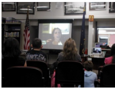
Author speaks about her book.